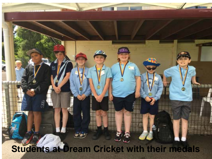
Students at Dream Cricket with their medals

Students participated in 7 rotations which consisted of a variety of cricket based skills such as bowling, batting and ball handling skills. These rotations were run by senior students from St John's College, Dubbo. They then shared a sausage sizzle lunch in the sun, followed by mixed teams in a game of 'run out cricket'. Students from all schools then received a medal of participation which was presented by members from the Rotary Club. All students participated to the best of their ability and represented Gilgandra Public School with pride and great respect.