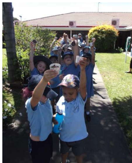
Students enjoying their chocolate cupcakes at Coo-ee Lodge

Please complete and return the marketing permission note by Thursday if you agree to the terms.